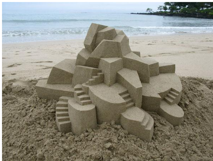
Sand Castle by Calvin Seibert 10

However, what happens if you add a little bit of water?